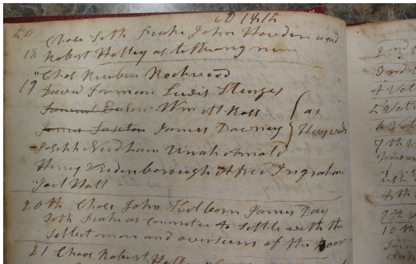
Bristol, Addison County, Vermont, Town Meeting Records 1810-1838, p. 50; Town Clerk's Office, Bristol.